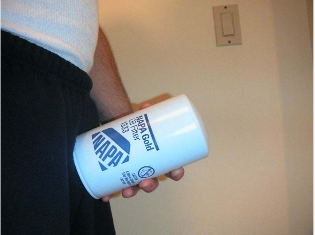
This bad boy increases your capacity to 5.3qts of fluid, which will keep you and your engine cool under fire. Never again will you have to deal with premature oil changes. Never again will you be made fun of. Never again will random passerbys point and laugh. You, my friends, will be oil filter studs. Rock on.