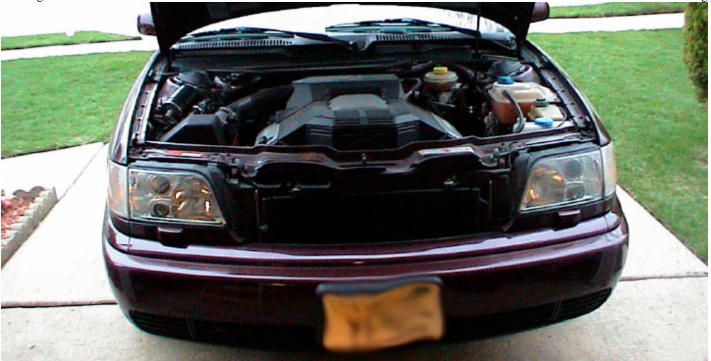
Driver side before cleaning